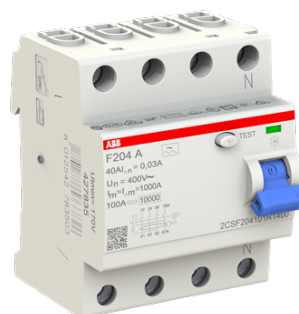
ABB Eco Solutions™